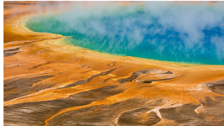
Grand Prismatic Hot Spring is the most photographed thermal feature in Yellowstone. That's because of its crazy-bright colors and its enormous size.

Stop at the Buffalo Bar after for a drink and eats